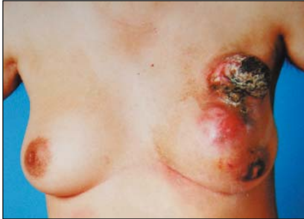
Fig.1. The tumor at the upper outer quadrant of the left breast, with skin ulcer (Case 4).