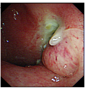
Fig. 2. Nasopharyngolaryngnoscopic images.

roughly normal; the physical state scoring indicated a KPS of 80. The results of the imaging examination were as follows: MRI showed that there was a thickening on the left-side of the nasopharynx and lateral wall of the oropharynx, with an abnormal signal and a clearly inhomogenous reinforcement. Left pharyngeal recess disappeared, and in the parapharyngeal space an abnormal fortified image could be seen. The left basilar region presented an inordinate abnormal intensification, with an approximate scope of 5.2×3.5 cm and an intrusion into the middle cranial fossa. No obvious abnormal signal was found in the accessory nasal cavity (Fig. 1); endoscopy (nasopharyngoscope): the left pharyngeal recess was covered by a yellow white necrotic tissue, and the left torus was rough, with congestion and tumescence. A few yellow and white sphaceluses were seen on surface of the lesion, and the biopsy tissue had a tenacious texture. There was an engorgement at the left-side opening of the auditory tube, which was not sharp. The right torus and pharyngeal recess as well as the opening of the auditory tube was well-defined and smooth (Fig.2). Pathological results of the biopsy (nasopharynx) showed chronic inflammation and necrotic tissue.